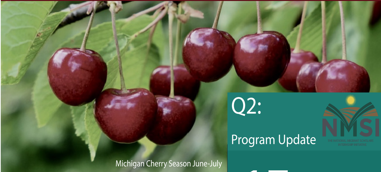
Michigan Cherry Season June-July