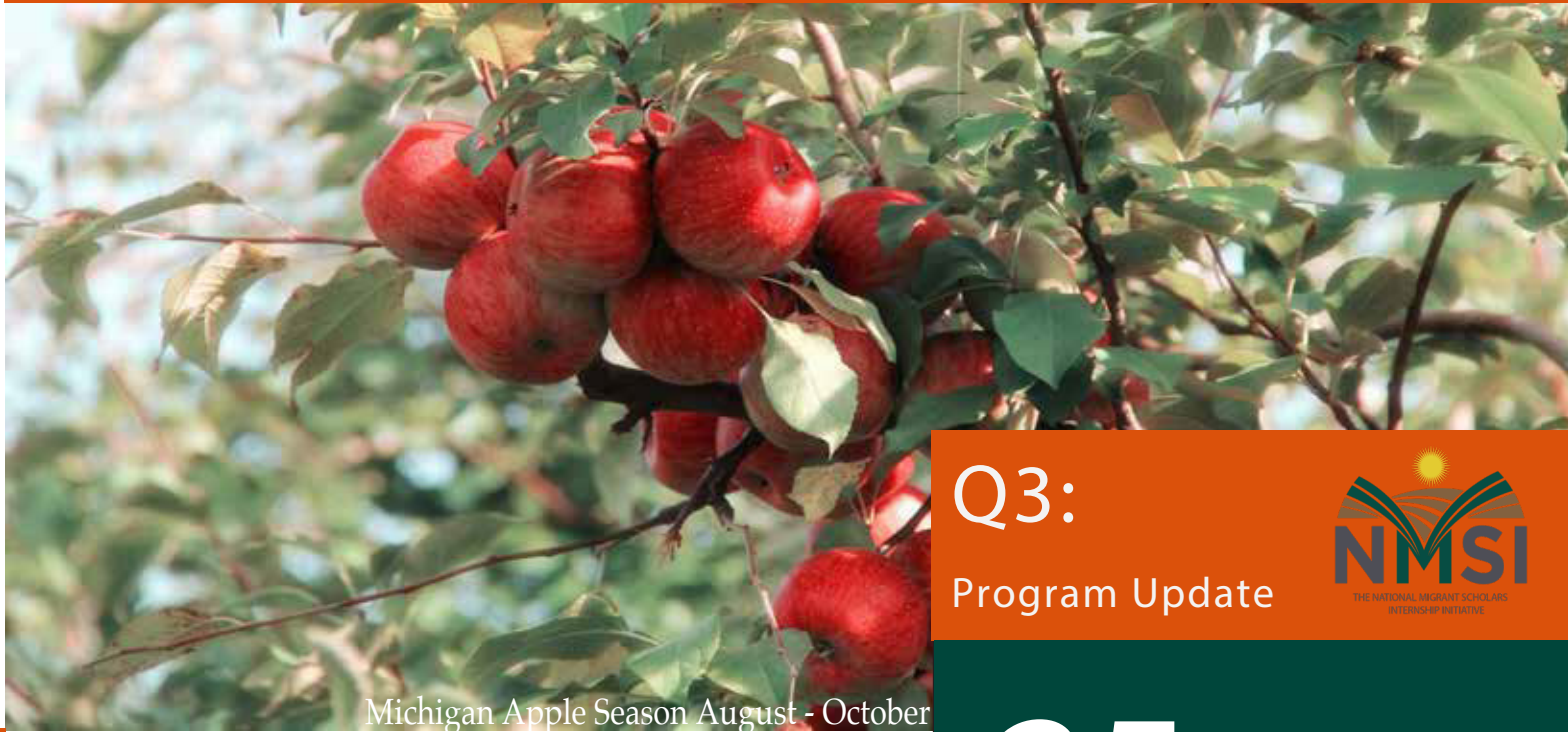
Michigan Apple Season August - October